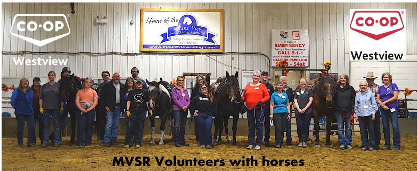
MVSAR Volunteers with horses

Thank You to Olds Regional Exhibition staff for the facility and assistance.